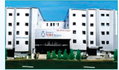
NRI General Hospital

The two lane beach road is extended from RK beach, Vizag upto Bheemili. While travelling from Vizag, sea will be at your right side. The road passes through many small alluring hills and snake like curves.