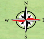
LAND USE ANALYSIS :-